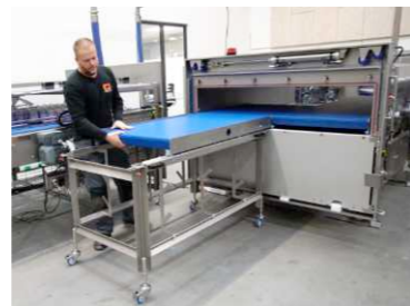
Hygienic design with easy access for optimum cleanability and change-over.