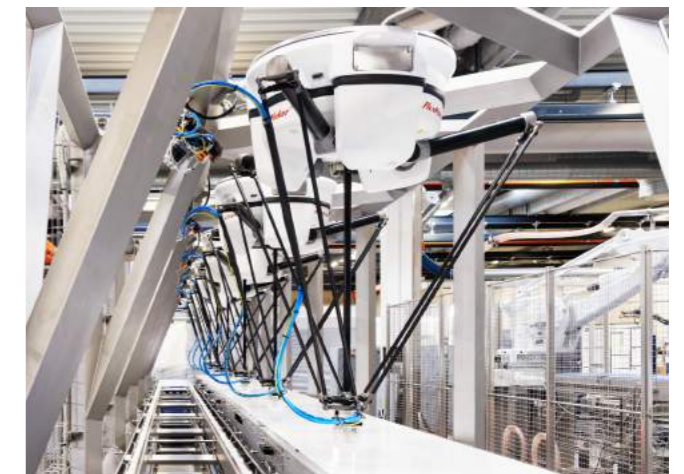
Pick & place system for pouches (pet food)