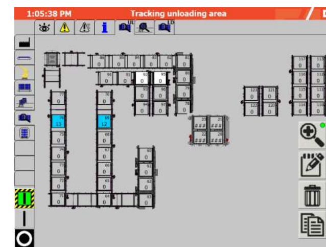
Full traceability: unloader area overview