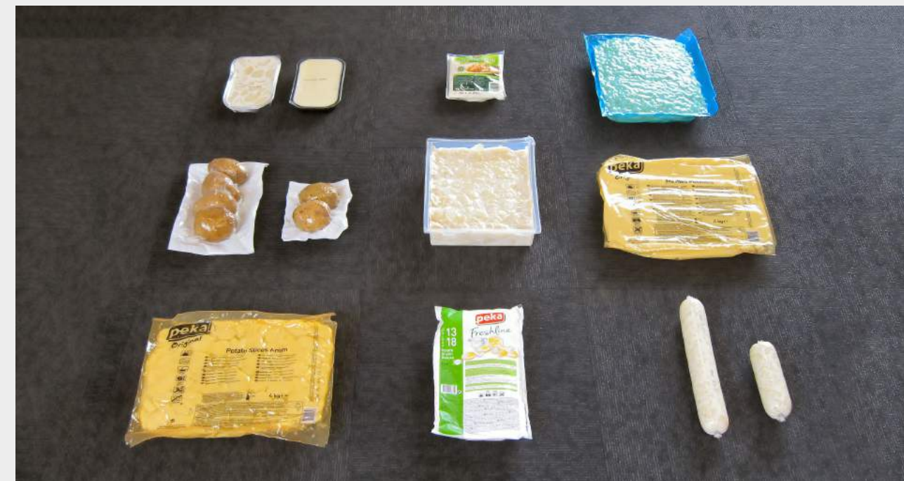
One solution fits all: one handling system for 12 different kinds of packaging

Full product traceability: reliable batch information, inspection and test data