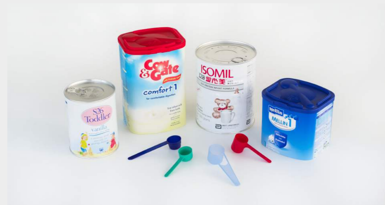
Handling of all kinds of powder packages, scoops and scoop caps