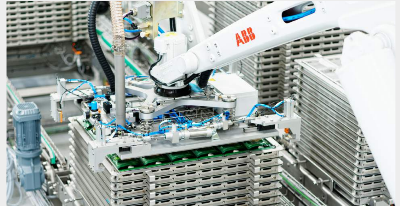
Jorgensen's All-In-One Solution: more productive with less equipment