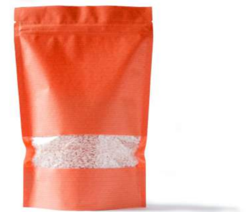
Efficient, reliable and safe handling of convenience food