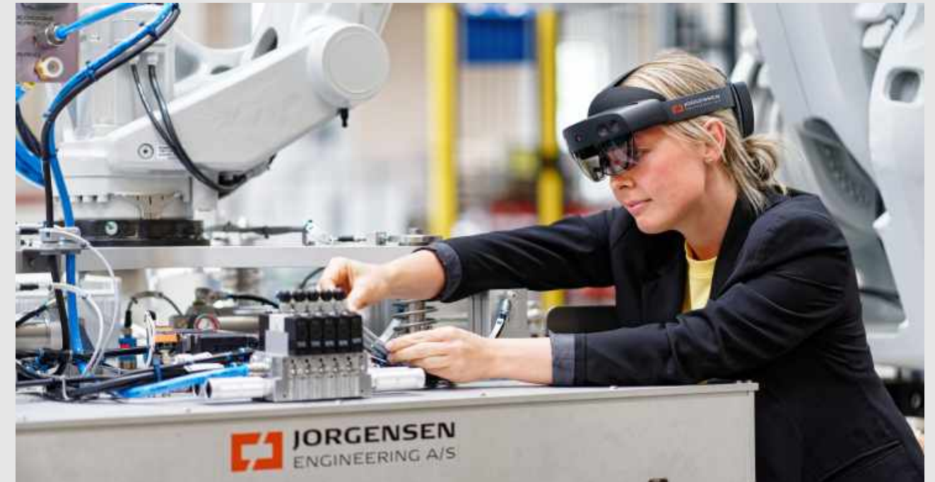
Innovative diagnostics using Augmented Reality