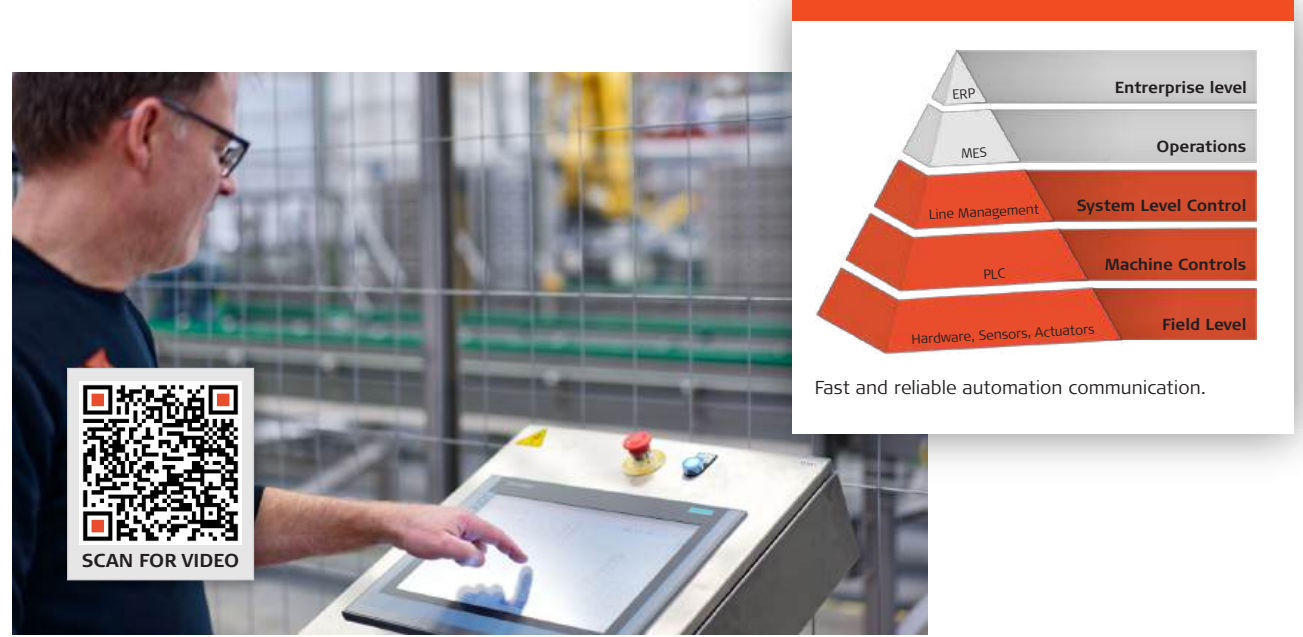
Intuitive user interface (HMI)

Communication across units with central line safety controller for e-stop coordination ensures high safety standard.