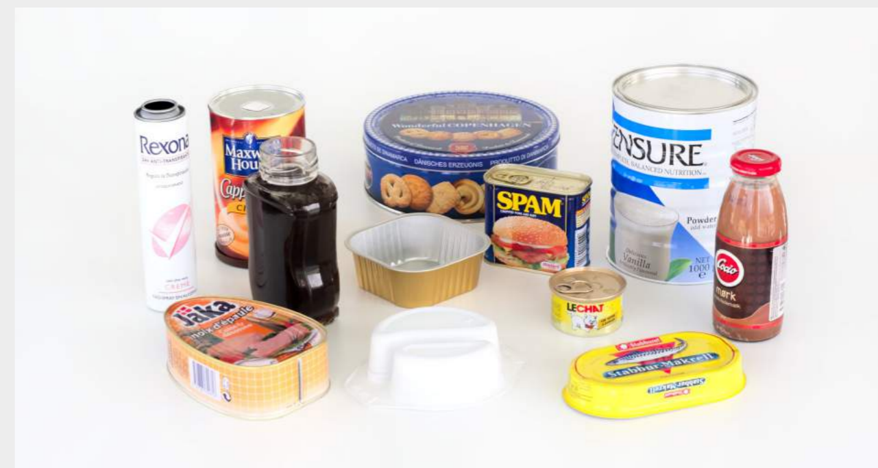
Depalletizing/palletizing of all kinds of packages