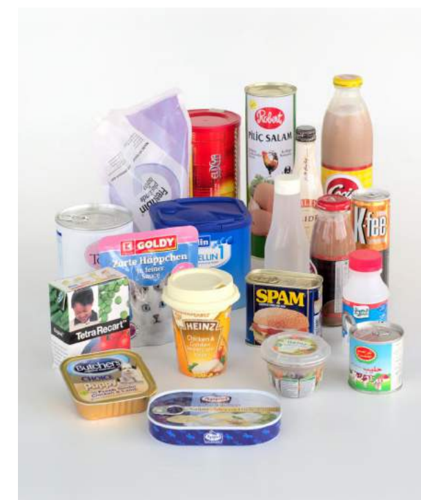
We handle all kinds of packages – challenge us!